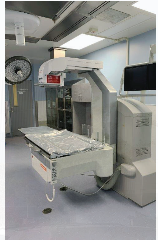
A new cystoscopy bed is more comfortable for patients and more ergonomic for staff.

To everyone who donated and made the O.R. their priORity last year, and on behalf of all staff and patients, the Foundation says thank you!