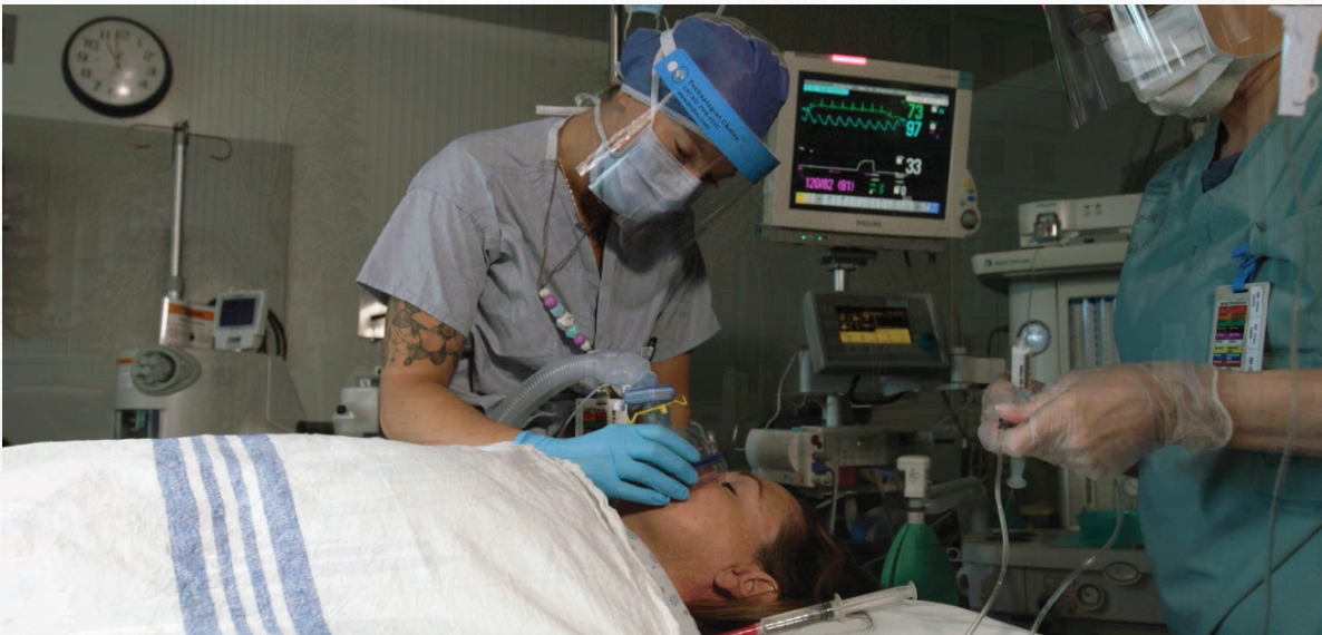
With 12 operating theatres, the Operating Room at Saskatoon City Hospital is very busy.